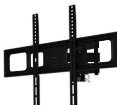
ARTICULATING WALL BRACKET